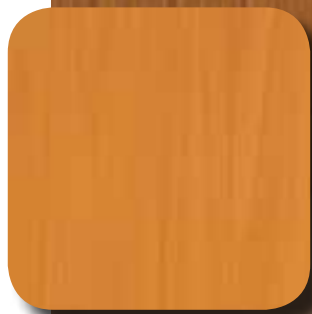
RD 066 | douglas