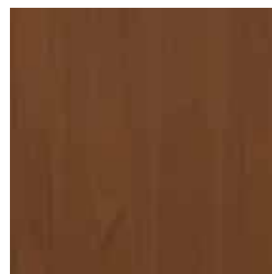
RD 088 | noce